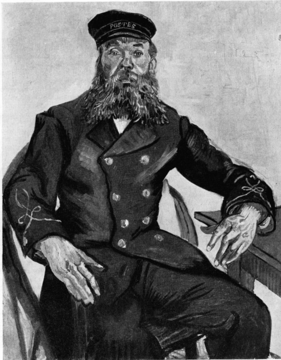
The Postman Roulin