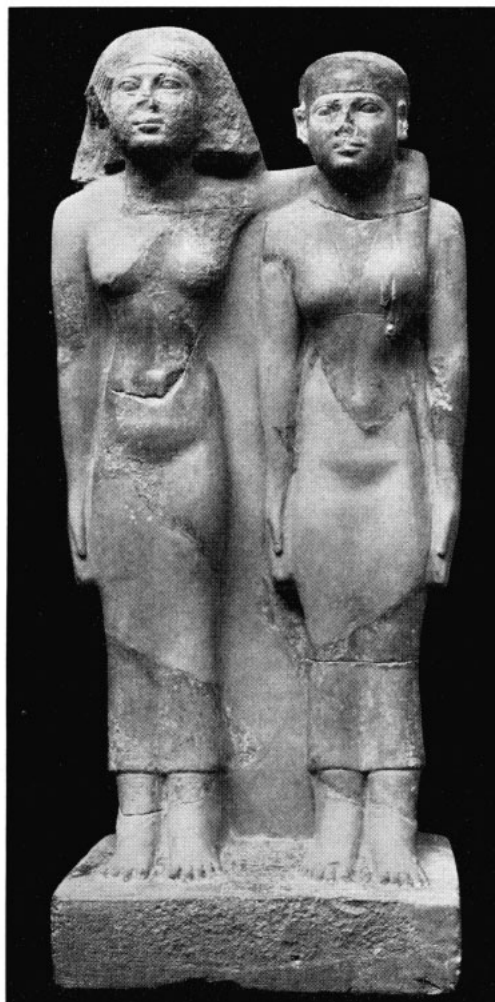
Restored Pair Statuette in Limestone of Queens Hetep-heres II and Meresankh III