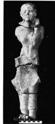
Original Fragments before Restoration