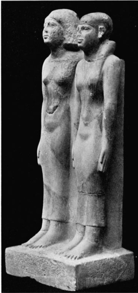
Hetep-heres II and Meresankh III